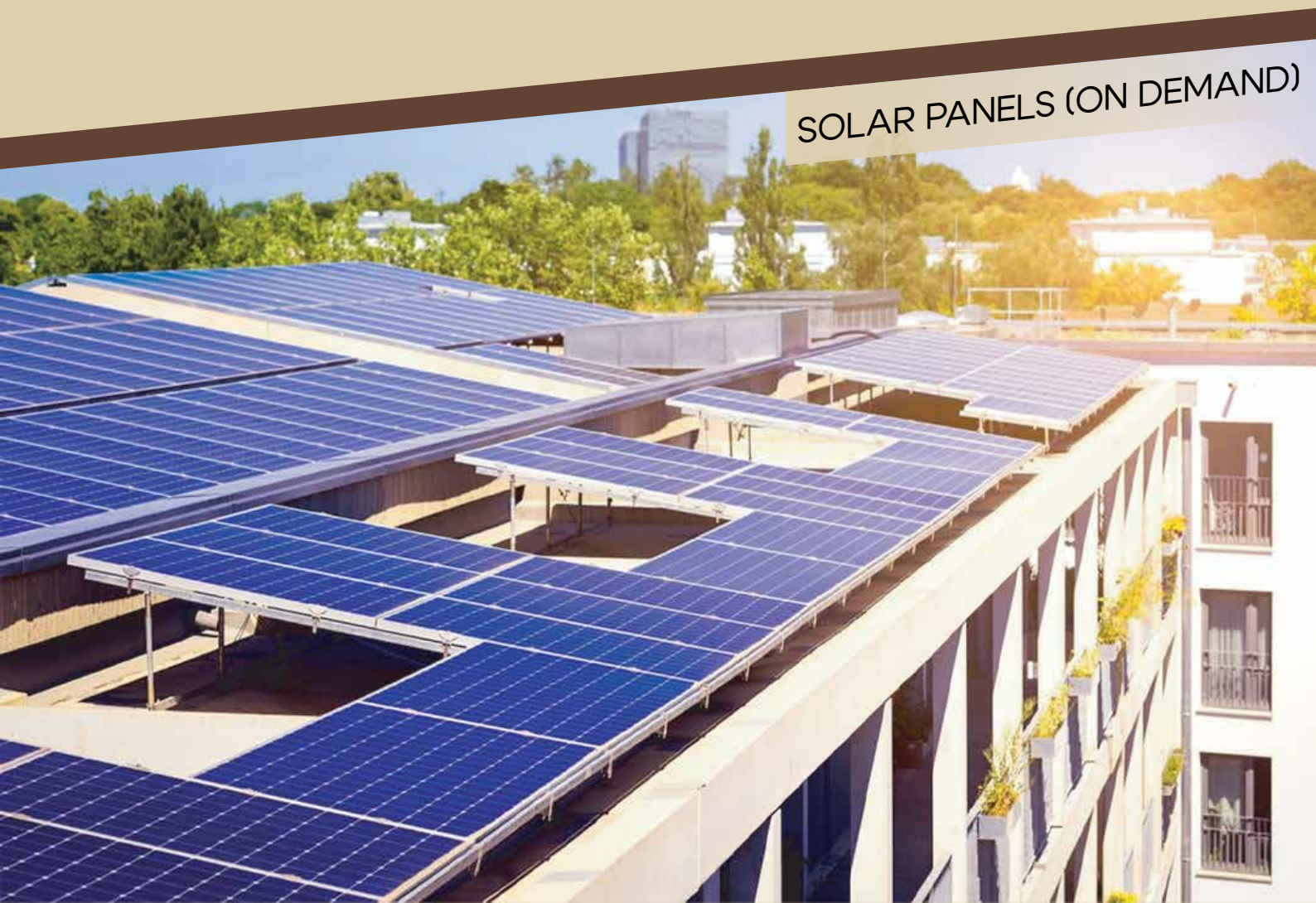
SOLAR PANELS (ON DEMAND)